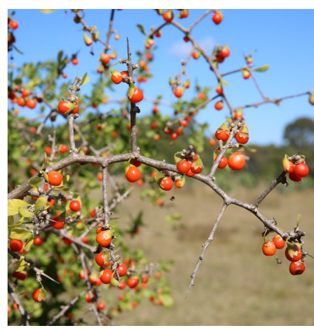
Proudly supported by the Australian Government Communities Combating Pest and Weed Impacts During Drought Program.